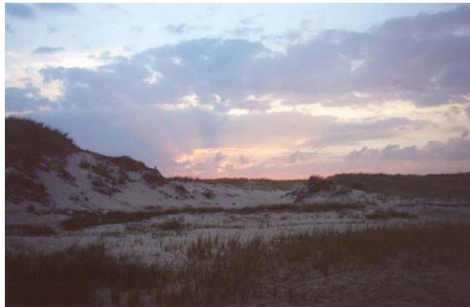
Sunset at Cape Cod National Seashore

For additional information about SCOR activities, please see the SCOR Web site: http://www.scor-int.org .