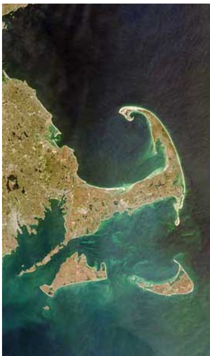
Cape Cod, Martha's Vineyard, and Nantucket Island

The Web site for the SCOR 50 th Anniversary Symposium (see https://www.confmanager.com/main.cfm?cid=1285 ), has the program, travel details, information about the poster session, and an on-line registration and payment system. The symposium will start with highlights of SCOR's history. This will be followed by three keynote presentations and several sessions that will seek to identify important future research topics. The symposium will be held in the Lillie Auditorium of the Marine Biological Laboratory, and hotel rooms have been reserved in Woods Hole and Falmouth.