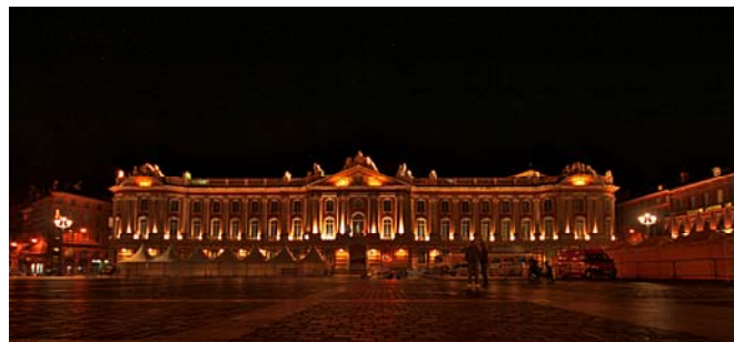
Place du Capitole, Toulouse, France